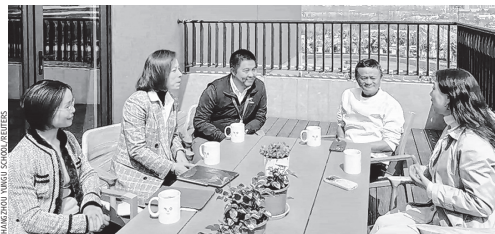
Jack Ma, second from right, visited a school in Hangzhou, according to a photo released Monday.

Scan this code for a video about Jack Ma's visit to a school in China.