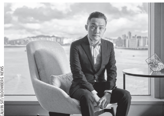
Justin Sun is pushing for new customers in Hong Kong and China.